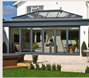
Aluminium Bi-Fold & Patio Doors