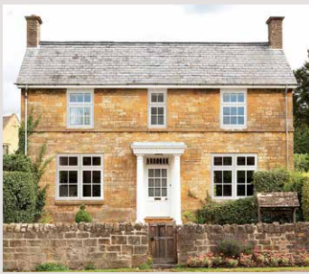
PVCu Windows & Doors