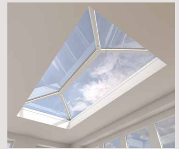
Conservatory & Lantern Roofs